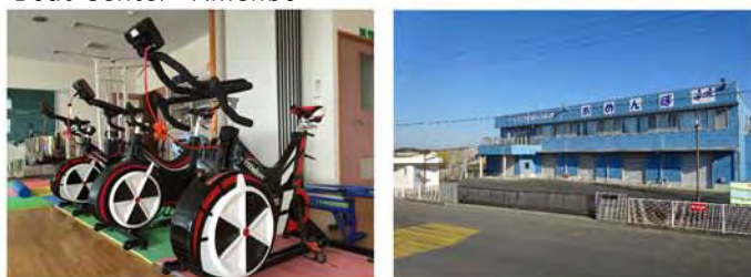
Boat Center "Amenbo"

Every kind of Machines for Weight-Training